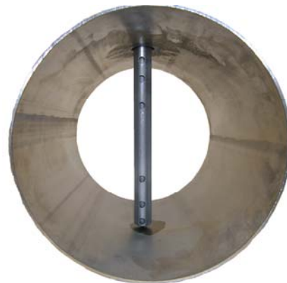
The profile of the deltaflow can even measure disturbed flow profiles with great accuracy, thanks to its multiple measuring point technology

You are thus benefiting from excellent stability in long-time use and drift-free measurement, while maintenance is kept to a minimum. This ensures that your regulating system works properly and accurately even after many years.